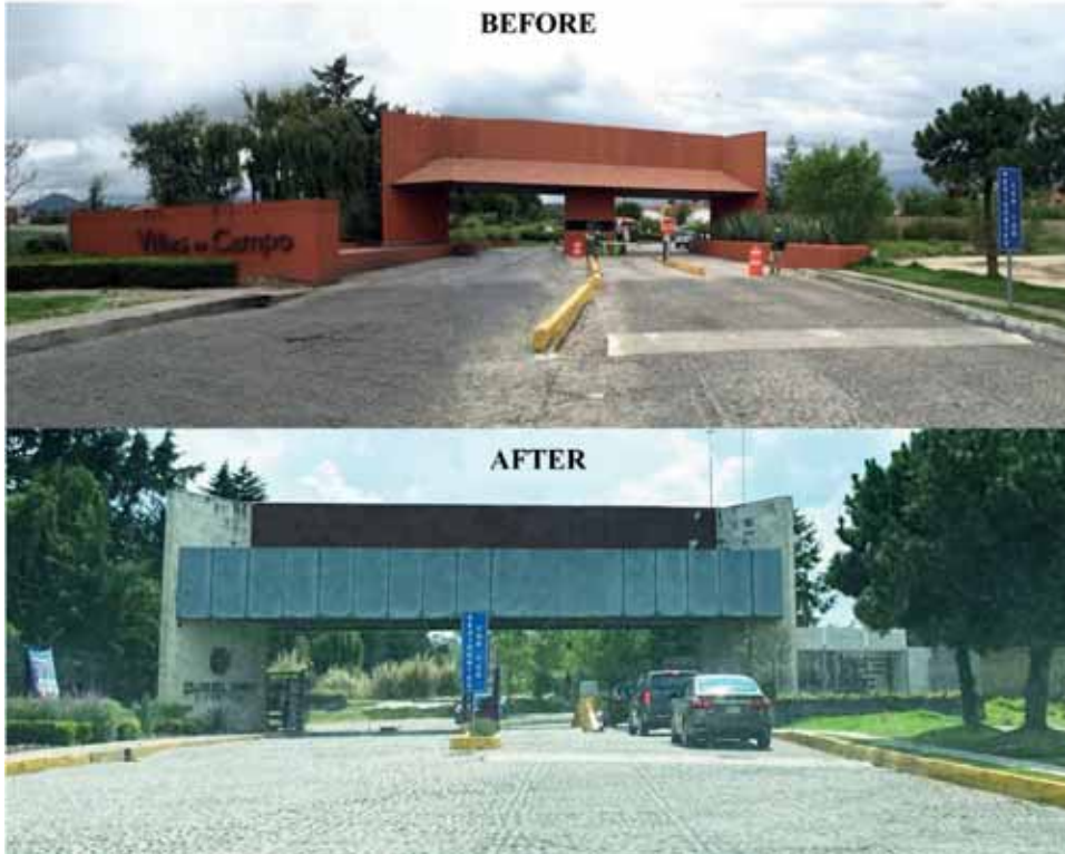
Figure 3. Public road access to the 'Villas del Campo' urban complex