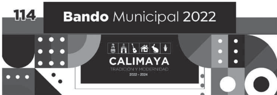
Figure 2. Prohibition published in Bando Municipal de Calimaya